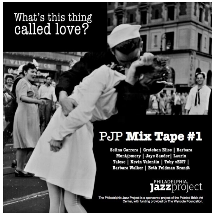
Philadelphia Jazz Project Mixtape #1